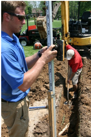
Drainage Project #7 North

While at Oakland Hills, employees will participate in all facets of the golf course maintenance required to maintain two championship golf courses at the highest level.