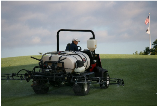
Chemical and fertilizer application

We are looking for hardworking turf students who want to join our staff. For the right individuals there are great opportunities for advancement at Oakland Hills.